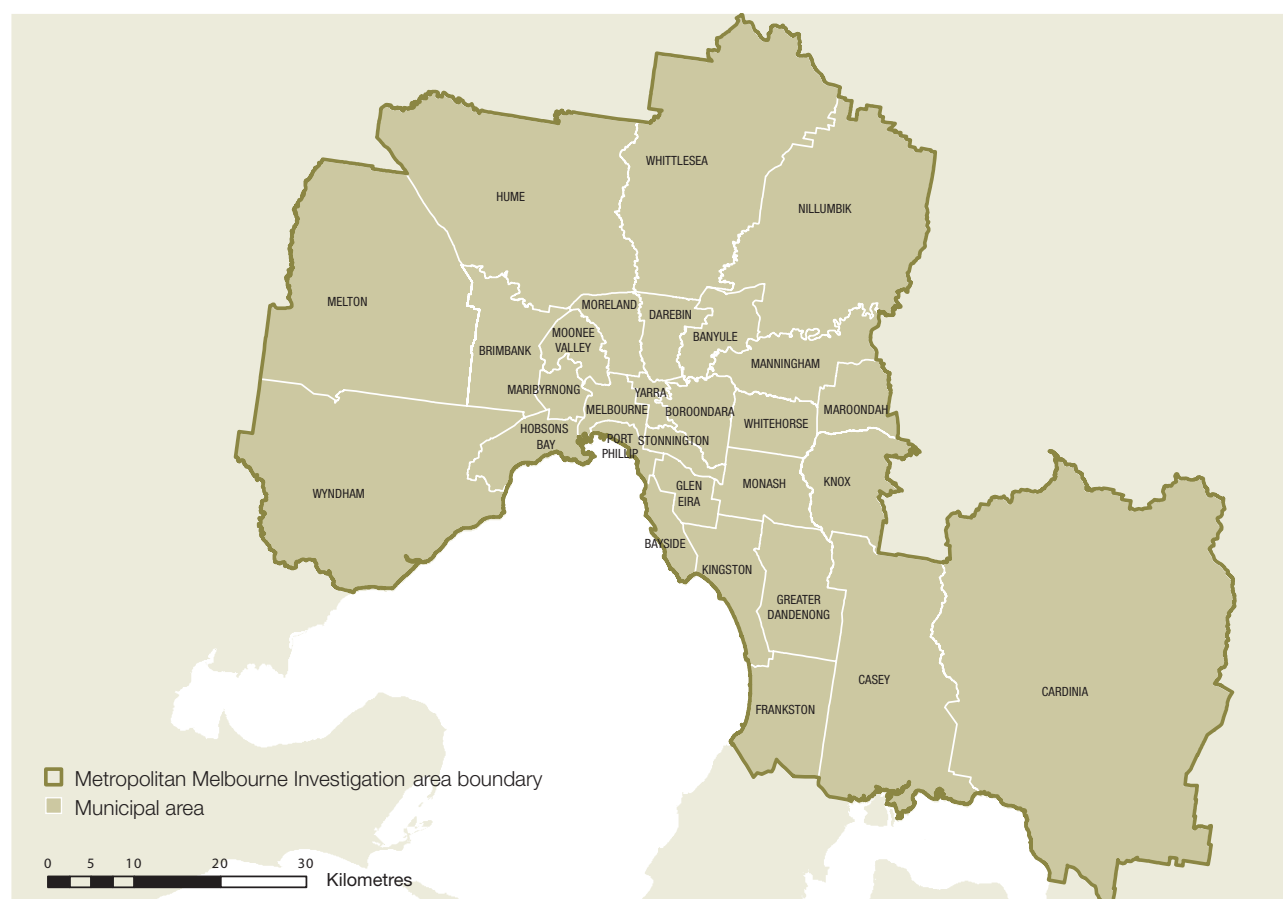
Figure 1.1 The investigation area