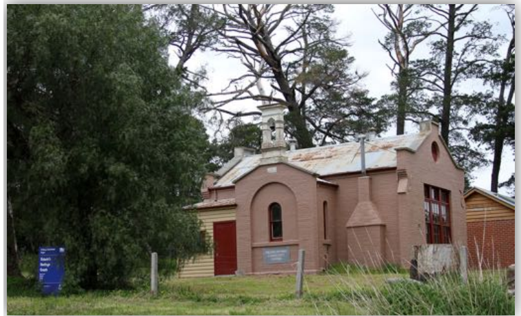
The former Franklinford Common School building was erected in the mid-1860s as the result of local initiative for a new common school. Source information: Victorian Heritage Database.

land grants and limited financial aid by the government and buildings were erected as settlements grew and funds were raised for the establishment of permanent structures. Early structures were often constructed on Crown land. Most of these titles were passed over to the occupants under the Abolition of State Aid to Religion Act of 1871.