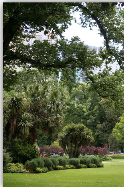
Fitzroy Gardens in East Melbourne were proclaimed in 1848 and have been in continuous use since the 1850s as a public garden. Source information: Victorian Heritage Database.

important examples of documented collections of living plants established for the purposes of scientific research, conservation, display, retention and education.