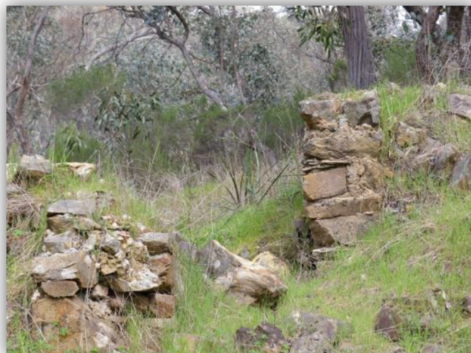
Eureka Reef, Castlemaine Diggings National Heritage Park. The Park comprises the remains of an authentic early 1850s goldfield, the site of a massive gold rush, which was influential in shaping Australia's history. Source information: Victorian Heritage Database.

notes, most of the goldfields were situated in 'wooded hills, ranges and valleys which had been lightly used or ignored and those finely balanced ecosystems were maintained by a mutual adjustment of slopes, drainage and vegetation cover which could not survive the miners' ferocious attacks'. 28 The evidence of human interaction with the environment in which gold seekers lived and worked has become a large-scale artefact exemplified by the Castlemaine Diggings National Heritage Park.