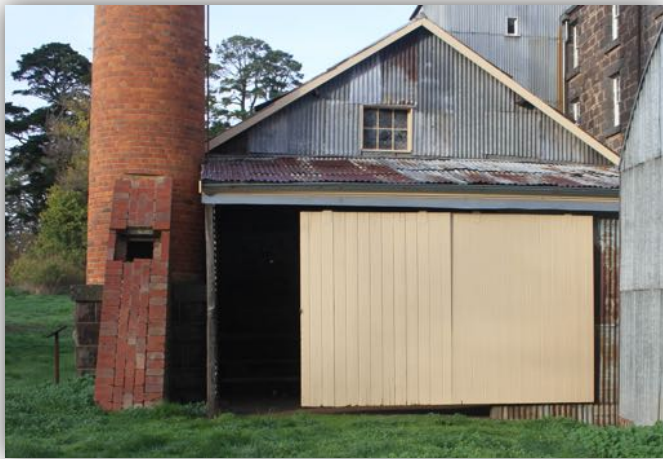
Anderson's Mill Complex, Smeaton, was built for the Anderson brothers from 1861 onwards to service Creswick's prospering agricultural district. The mill operated as a flour and oatmeal mill before it closed in the late 1950s.

processors. 35 The grain industry depended on mills, many of which were established in rural areas.