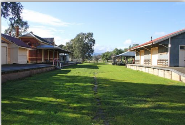
The former Yea Railway Station complex, built in the late 1880s, is the most intact example of a small group of standard Gothic-styled Railway Station buildings. Source information: Victorian Heritage Database.

Tracks were turned into roads when the Central Road Board was established in 1851 to oversee the construction of a road network in the colony of Victoria. The responsibility for road works was handed over to local districts, with support given through government grants, rates, and tolls under the Roads Act of 1853. Machinery was purchased for road making and tollgates erected to collect the necessary funds for road building. The building of roads enabled the establishment of a network of coach routes to transport passengers and mail throughout the colony.