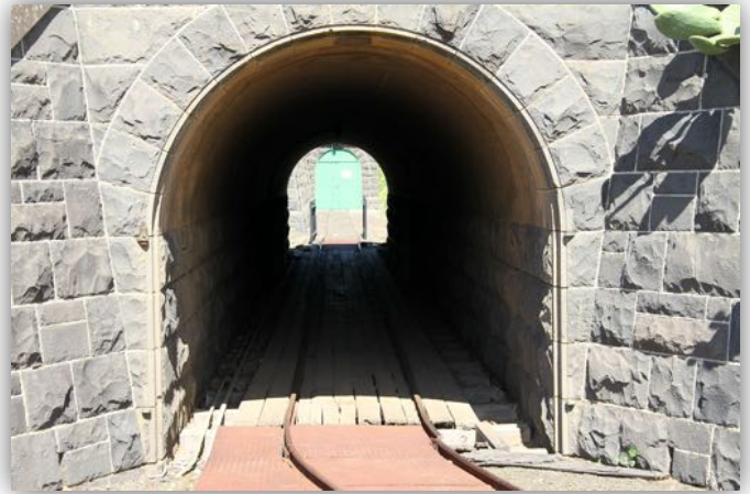
Built in the period 1876-78, Jack's Magazine in Maribyrnong is the largest gunpowder magazine complex ever constructed in Victoria, a direct manifestation of the importance of mining in Victoria's history. The magazine was used to house the Footscray Ammunition Factory from the 1920s. Source information: Victorian Heritage Database.

During the late nineteenth century, railway and transport infrastructure were substantially expanded, and the Port of Melbourne developed to facilitate increasing international trade.