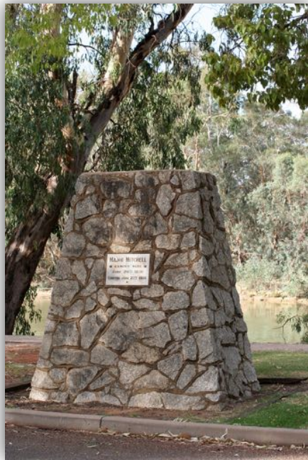
A cairn marks Surveyor-General of New South Wales Thomas Mitchell's 1836 campsite on the River Murray at Swan Hill.